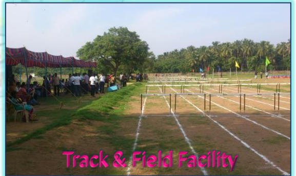
Track & Field Facility