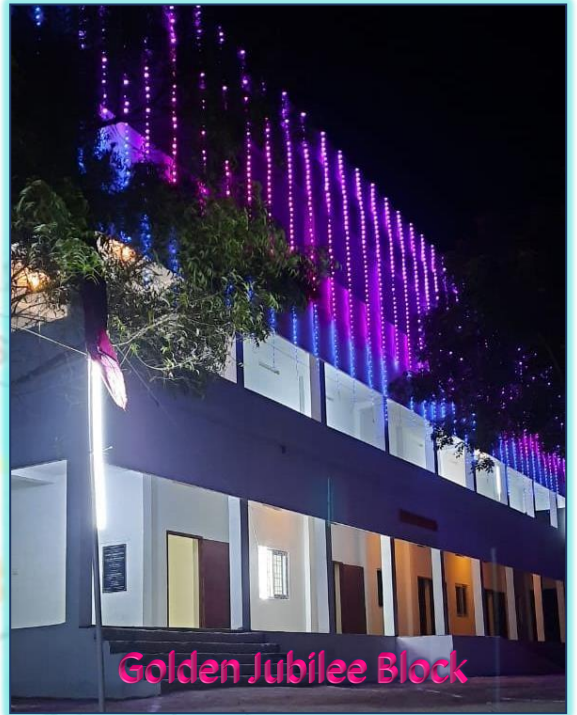
Golden Jubilee Block